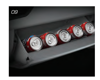
7 - Adjustable headrests on front seats. 8 - Height adjustable driver's seat to ensure driving comfort. 9 - Cooled glove compartment.