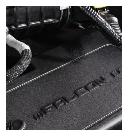
The all-new mFalcon engines provide ample power to ensure a peppy, responsive drive without compromising on fuel economy. The Diesel variant in fact produces a 'best-in-class performance against other diesel SUVs.